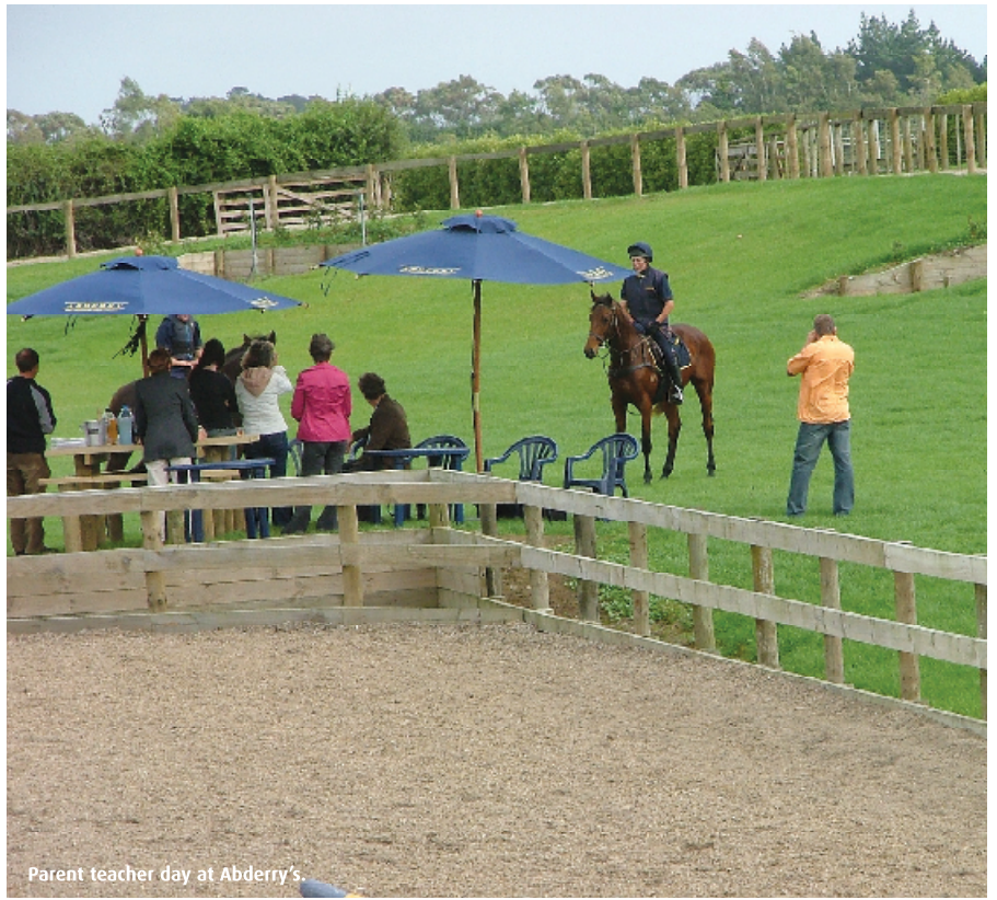
Parent teacher day at Abderry's

The team at Abderry Equine Services always communicate openly and are constantly discussing and evaluating individual approaches and techniques. You can be confident when you send your horse to Abderry it will be given the time it needs to learn without pressure. Abderry will prepare it so it is ready to strike up a confident working relationship with all its future handlers.